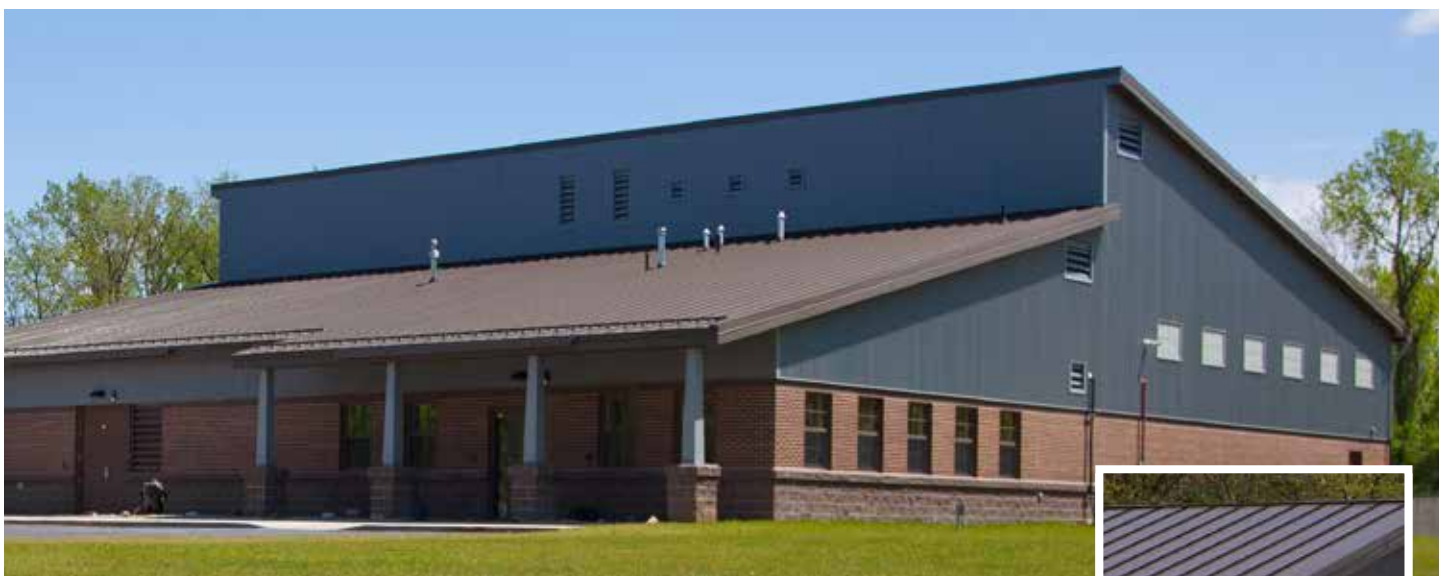
Allegan Water Treatment Plant, Allegan MI, USA

"For the Allegan Water Treatment Plant, we conceived a barn-like feel to fit the context of the surrounding pastoral landscape. Metal was the first material that came to mind with its durability, low maintenance and color availability."