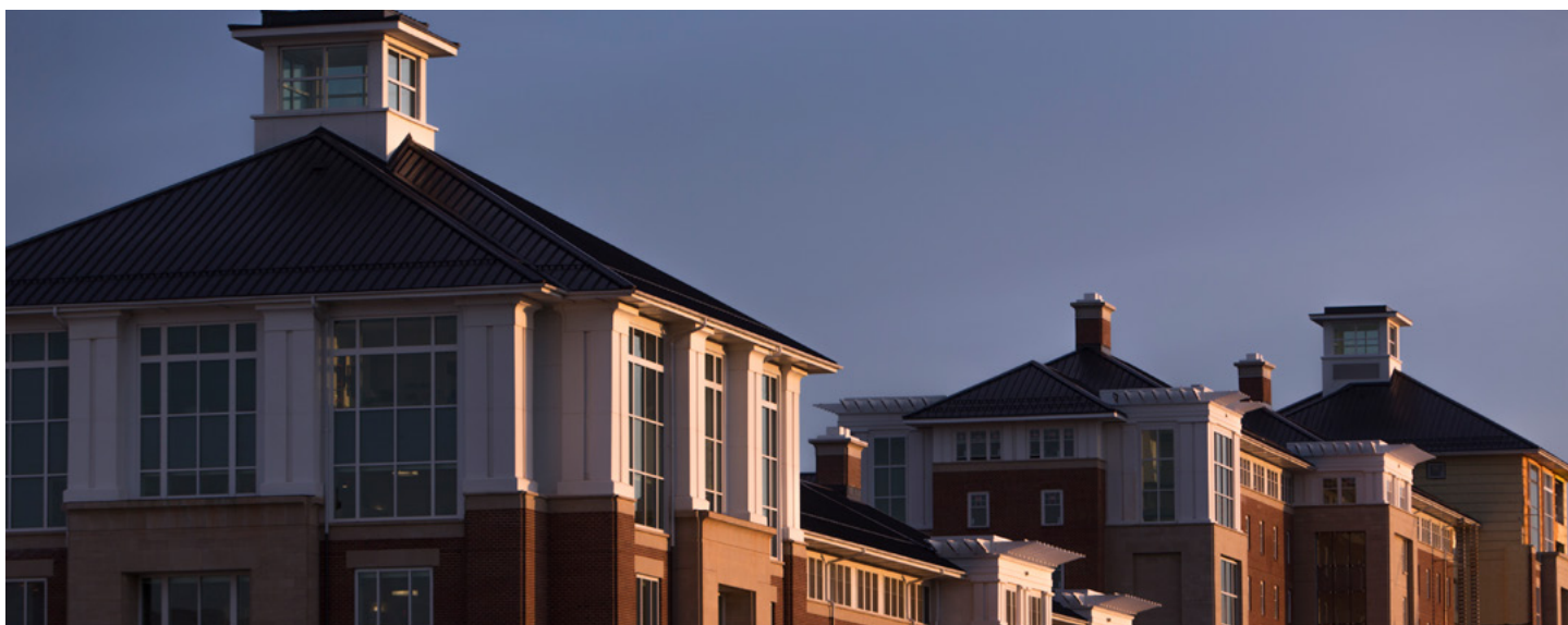
Liberty University Commons, Lynchburg, VA, USA

Fabral offers everything you need to make metal work for you.