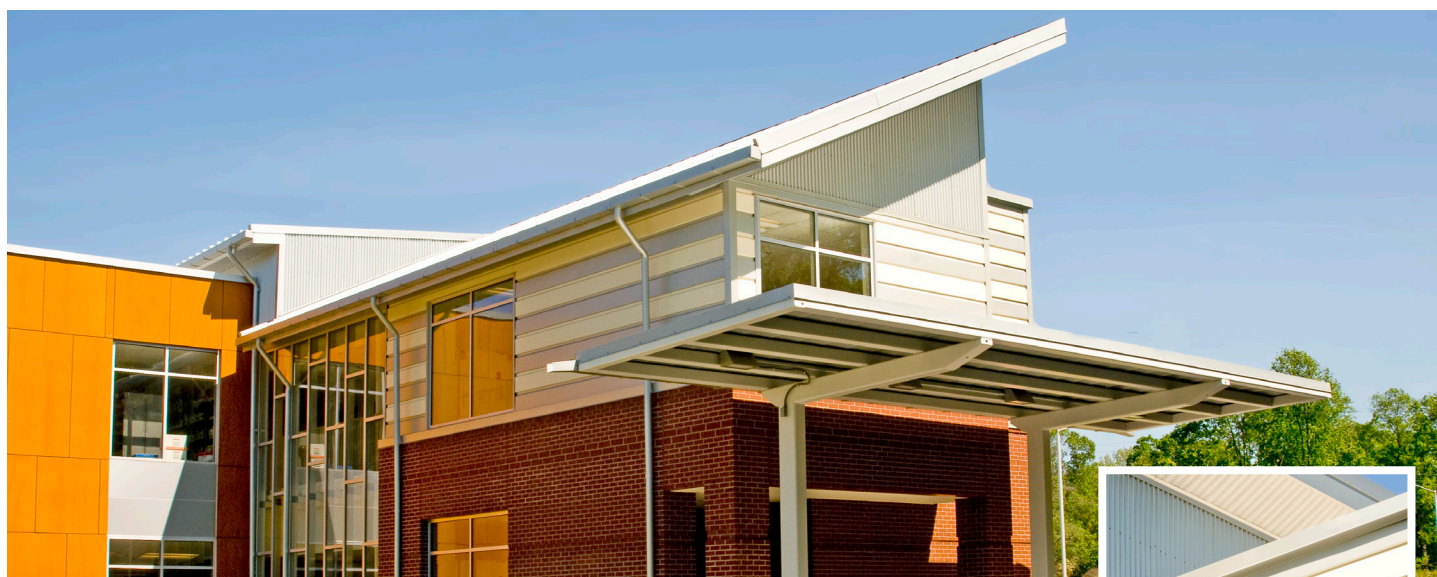
College Park Elementary School, Virginia Beach VA, USA

“For the design of this elementary school project, we needed to visually break up the façade. The HCF Series gave us more color options and the flexibility to integrate color in the design.”