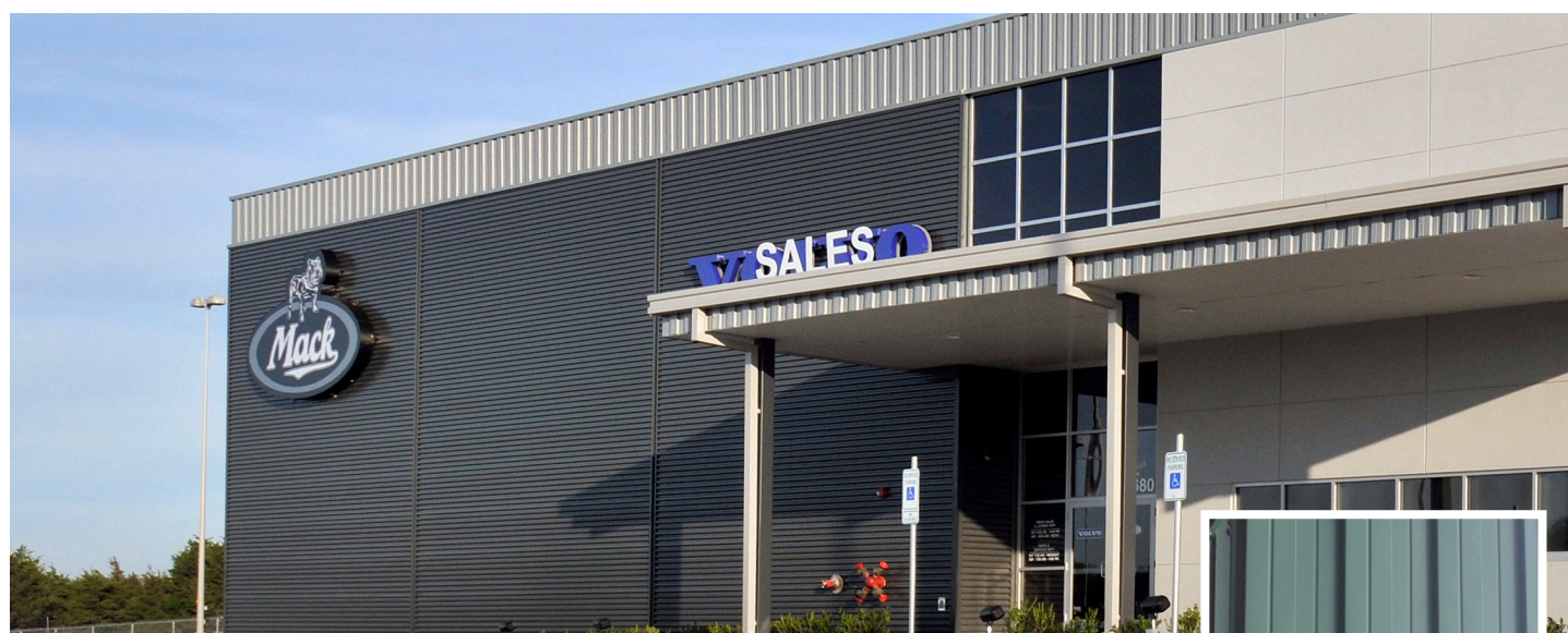
Brutner Truck Sales, Dallas TX, USA

Fabral® Select Series® 612 is the perfect wall panel option when you need to add more dimension to a project. In Fabral® standard color, Old Town Gray, the Select Series® panel gave this pre-engineered building a bold accent by adding it to the roofline.