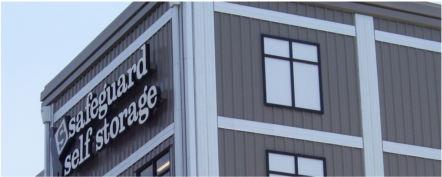
Safeguard Self Storage, New Orleans, LA, USA

Fabral®'s Mighti-Rib® panel is perfect for use in Self Storage buildings as well as other industrial and government design projects. 280 squares of Mighti-Rib® in Slate Gray were used to complete this large project. Mighti-Rib®'s versatility makes it easy to specify and easy to install.