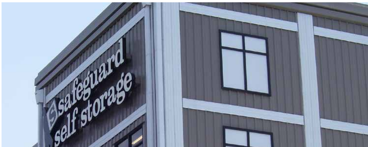
Safeguard Self Storage, New Orleans, LA, USA

Fabral®'s Mighti-Rib® panel is perfect for use in Self Storage buildings as well as other industrial and government design projects. 280 squares of Mighti-Rib® in Slate Gray were used to complete this large project. Mighti-Rib®'s versatility makes it easy to specify and easy to install.