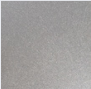
Charcoal - WXA0111T SR .33 TE .88 SRI 35 ■ ◆

Unique textured perfection for the ages with WeatherXL™ Crinkle Finish, the new super-strength effects finish from Valspar® for GrandRib 3 Plus.