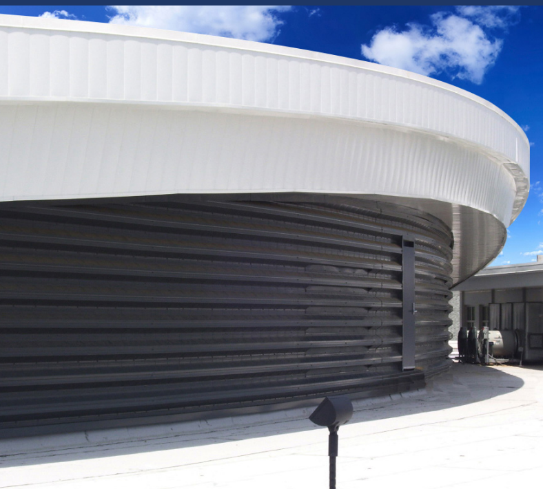
Auburn University Basketball Arena, Auburn, AL