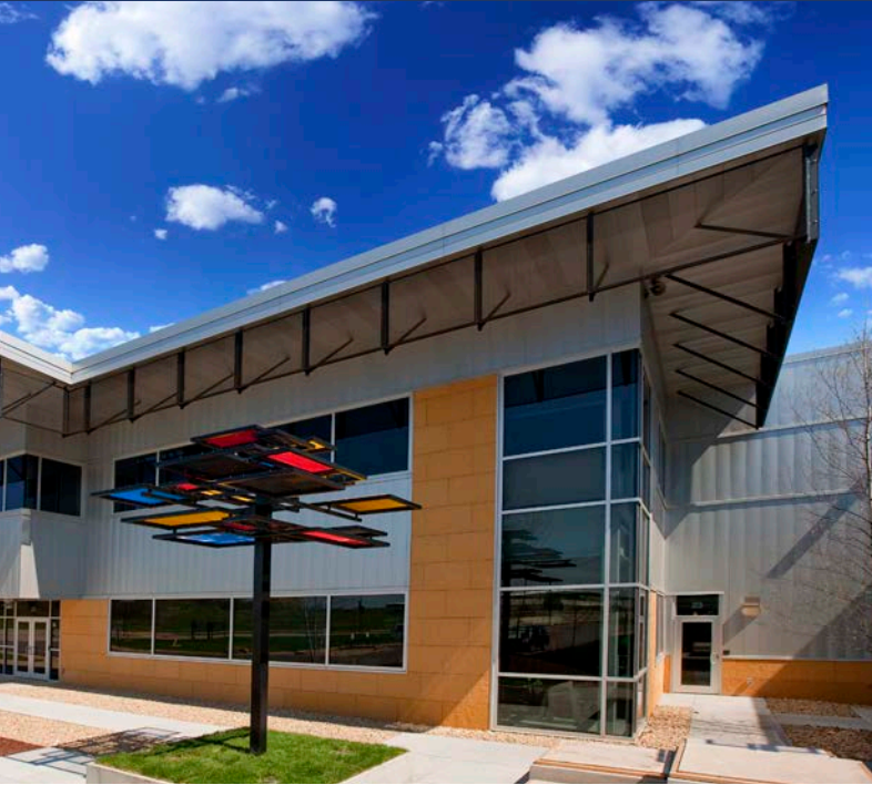
Electronic Theatre Controls, Middleton, WI