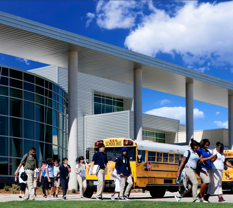
Lady Bird Johnson Middle School, Irving, TX