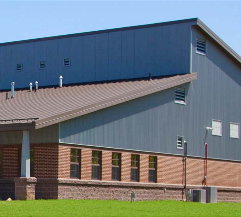
Allegan Water Treatment Facility, Allegan, MI