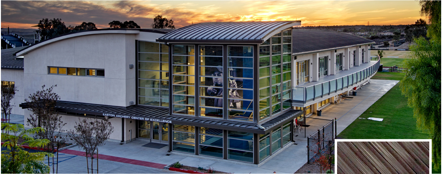
Easton Archery Center, Chula Vista, CA

For the indoor archery range, where even the slightest air movement from an HVAC unit can cause a major disturbance for athletes, the design team needed a roofing solution that would aid in climate control and fit the curved radius, PowerSeam accomplished that.