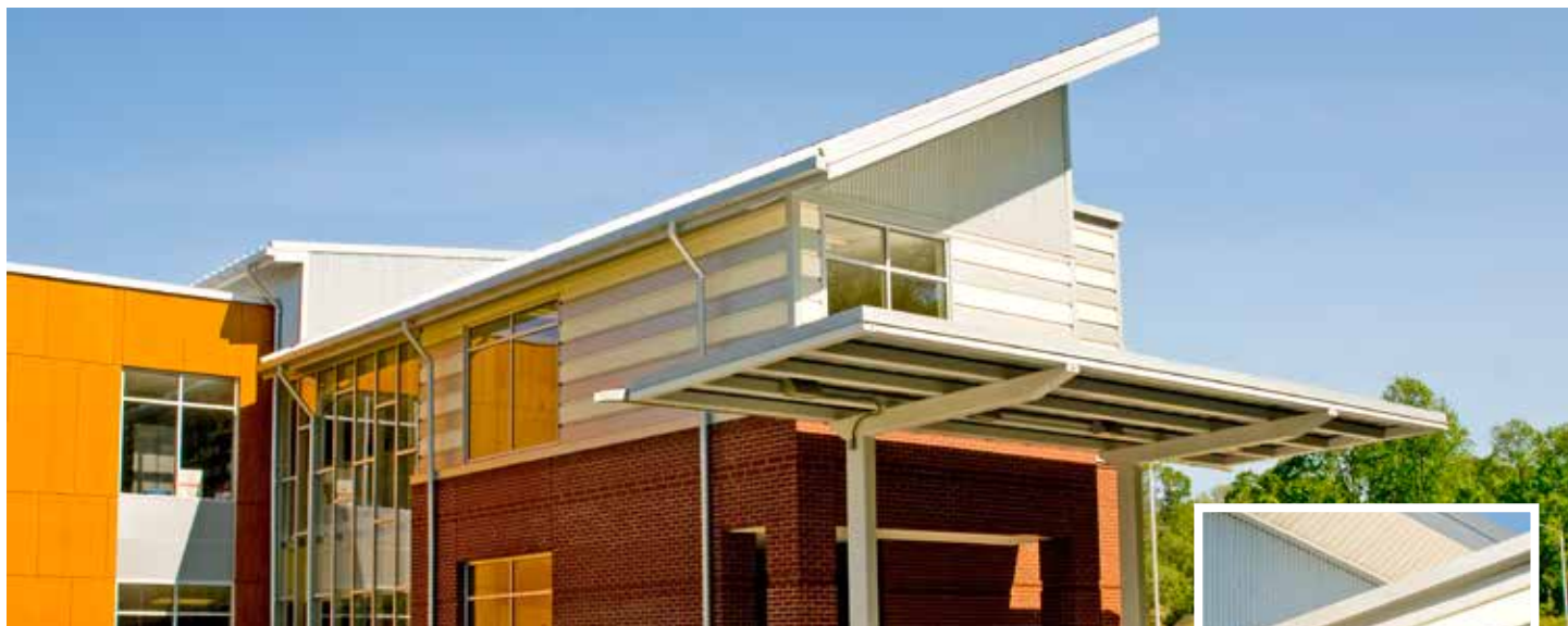
College Park Elementary School, Virginia Beach VA, USA

“For the design of this elementary school project, we needed to visually break up the façade. The HCF Series gave us more color options and the flexibility to integrate color in the design.”