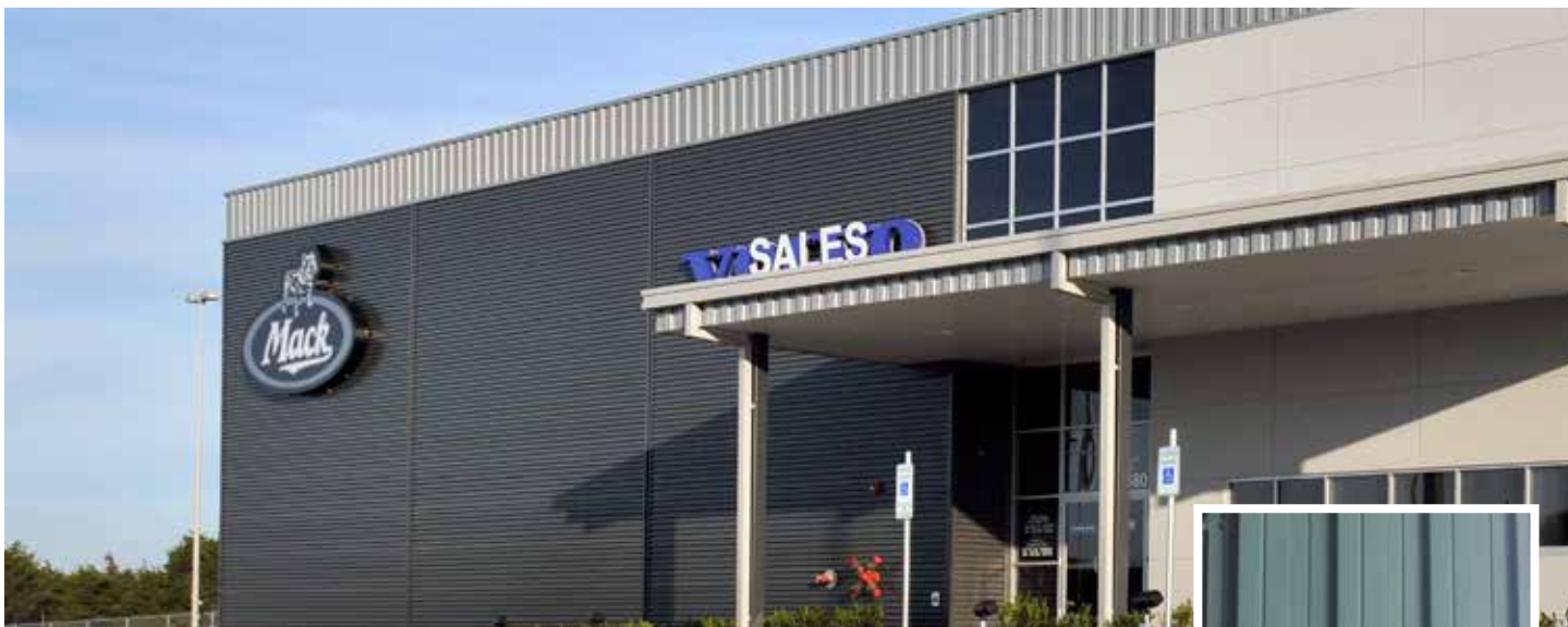
Brutner Truck Sales, Dallas TX, USA

Fabral® Select Series® 612 is the perfect wall panel option when you need to add more dimension to a project. In Fabral® standard color, Old Town Gray, the Select Series® panel gave this pre-engineered building a bold accent by adding it to the roofline.