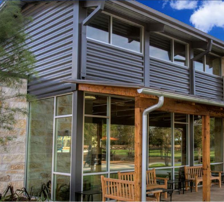
4.0 Wine Cellar , Fredericksburg, TX