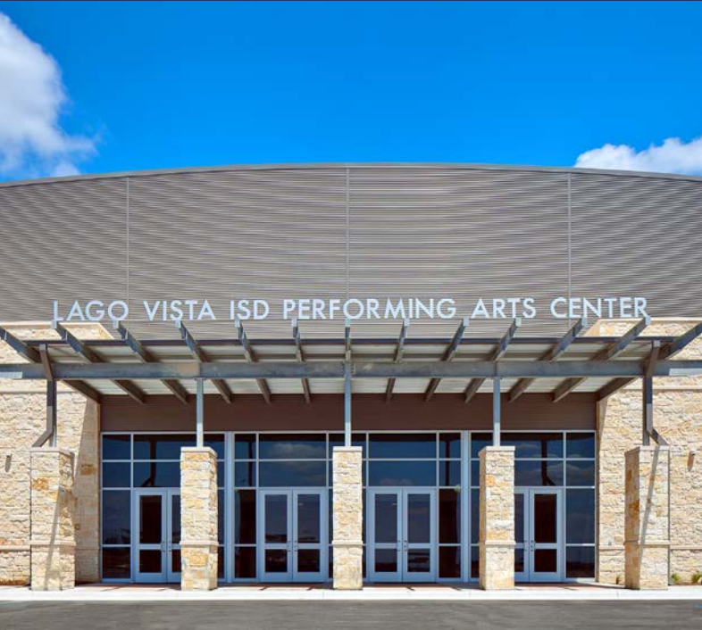
Lago Vista High School, Lago Vista, TX